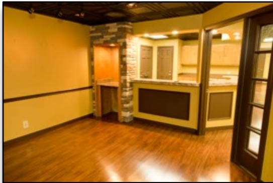
Room #1: Dental Chair or hygienist chair