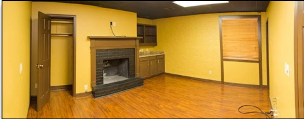
Room #3: Office, Dental Chair or hygienist chair